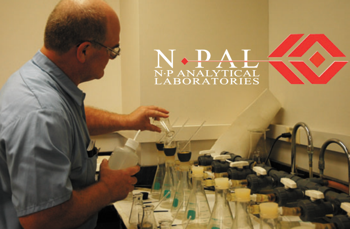
An NPAL associate conducts analytical work in the St. Louis-based facility.