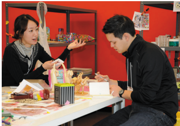
Nestlé Purina's state-of-the-art Innovation Center at Headquarters contains elements designed to inspire idea generation and collaboration among associates.

Nestlé Purina associates are the source of our competitive advantage, through their skills, capabilities and creativity. The Company is committed to attracting, recruiting and retaining associates from diverse backgrounds who exemplify our core values of integrity, passion, expertise, innovation and a relentless dedication to performance. Our culture of teamwork and collaboration ensures that our associates grow professionally, gain useful skills and succeed. We offer competitive pay and comprehensive benefit programs that include health and wellness initiatives and world-class learning and professional-development opportunities. Our career paths can lead people through a number of factories and office locations throughout the United States and literally all over the world.