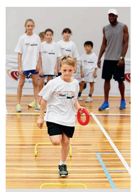
Supporting Australian kids' athletics In April 2014, Athletics Australia launched the IAAF Nestlé Healthy Active Kids' Athletics to boost participation among young people. The pilot will be offered to Australian children through the national after-school care scheme, and more than 100 children attended a sports clinic run by Australian and American champions to launch the programme.