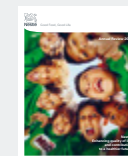
2018 Annual Review