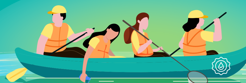
Cleaning up canals