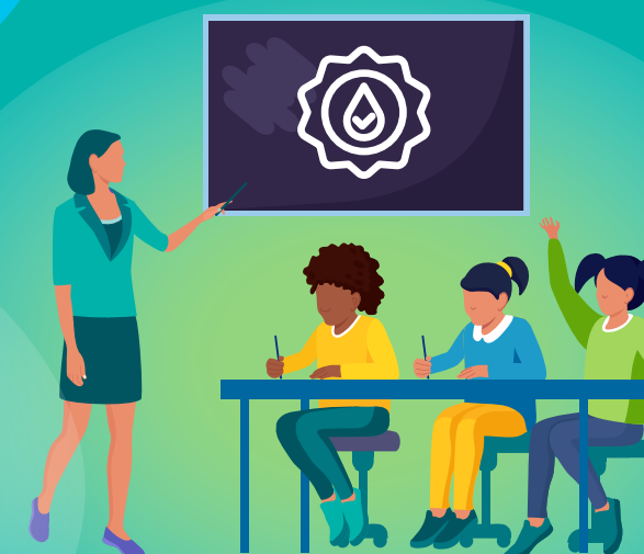
Education on water protection