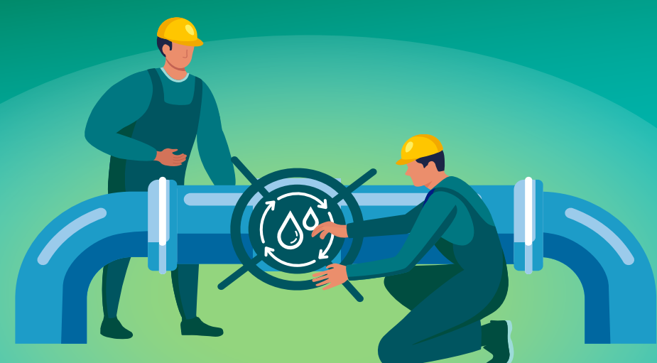
Water infrastructure projects

Watersheds refer to the area of land from which all surface run-off flows through a sequence of streams, rivers, aquifers and lakes into the sea or another outlet. They are essential to communities, agriculture, industry and biodiversity