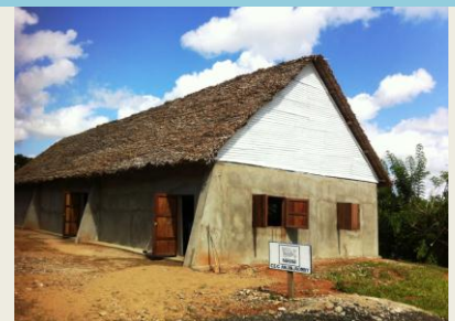
Centre d'éducation Général d'Anjinjaomby (high school)