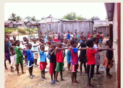
Antakôly village (school)