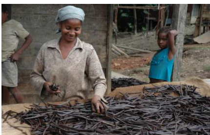
Traditional curing of vanilla beans

“The commercial relationship we have with Floribis, since 2009, has positively impacted our life into the bush. It has reduced the rate of illiteracy among adults and has also given us the opportunity to provide education to our children. With the Fairtrade premium 1 we received, we have built in our village, school buildings for our boys and girls”