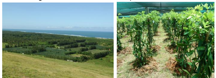
Mane's vanilla plantation (Floribis)