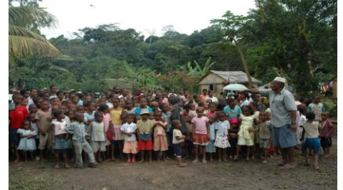
Pupils from the FITAMA cooperative supported by Mane/Floribis