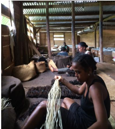
Collector's house selling to Henri Fraise Fils