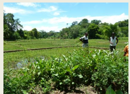
Rice fields applying SRI technique