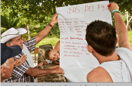
Understanding local water challenges in Ecuador to improve water management.

During the last 100 years, water use for agriculture has been constantly growing. Massive improvements in hydraulic infrastructures have put water at the service of people. Agricultural productivity has grown, thanks to new crop varieties and fertilizers, further fuelled by irrigation water. The improved use of water for irrigated agriculture benefited farmers and rural communities –