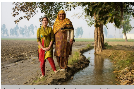
Improving rural communities knowledge on water through the Farmer Water Awareness Programme in India

Irrigation and drainage of fields impact water flows well beyond the farm premises. Through water stewardship, a well-managed irrigation system leverages all stakeholders' interests. In some regions, irrigation and drainage is realized through large scale infrastructure projects usually put in place accompanied with determined irrigation schedules. However, in many places, well managed irrigation system are missing. In such environments water stewardship plays a key role in raising awareness and facilitating the development of integrated water resource management plans.