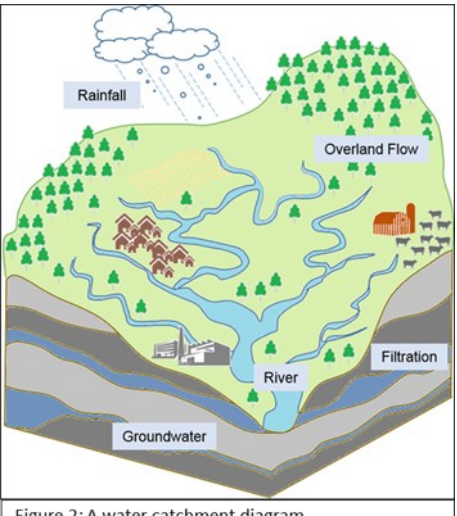
Figure 2: A water catchment diagram.

Water stewards in agriculture recognize how water is used at the farm level, understand quantities and qualities of water available, where it comes from and where it flows to. Hence water stewards also care for appropriate drainage, wastewater