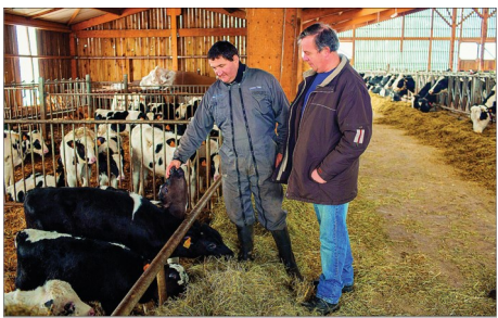
Visiting farmers near Vittel, France, to discuss farming methods that avoid polluting groundwater.

There are two types of water pollution origins: nonpoint source and point source pollution. It is generally accepted that most pollution from agricultural practices is treated as nonpoint source pollution as there is no obvious point of entry of pollutants.