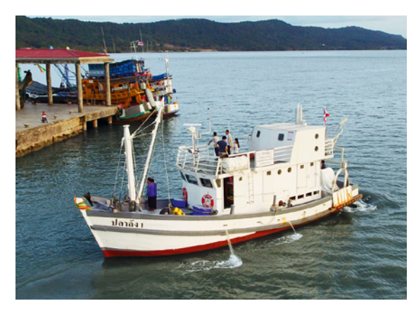
Responsible sourcing in pet food: in partnership with the Thai Government and a supplier, we have developed a showcase vessel. It is used in trainings to address labour rights abuses in the seafood industry.