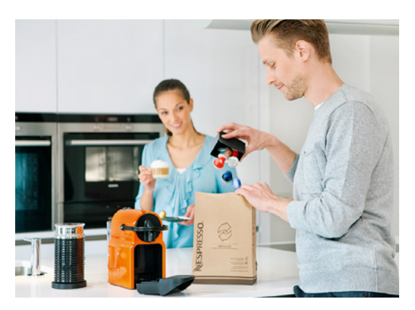
Nespresso continues to extend its global recycling scheme and invested CHF 25 million in 2017.