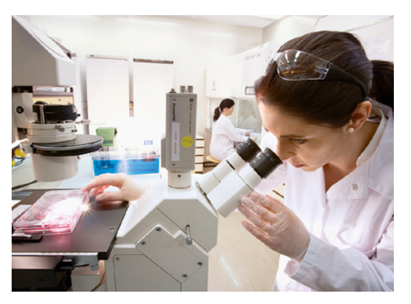
In 2016, we announced a new way to structure sugar particles that allows us to reduce the sugar in some of our confectionery products. We scaled up our technology in 2017 and 2018 will see our first launches.