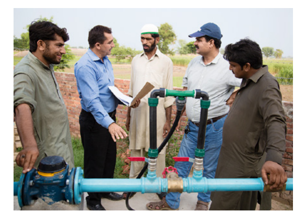
The Nestlé Pakistan water plan was unveiled in October 2017, in collaboration with Lahore University of Management Sciences and WWF. It promotes water resources conservation, introduces sustainable agricultural techniques, and provides access to clean and safe water.

By offering consumers more sustainable foods and beverages, we provide them with more reasons to choose our brands, generating additional revenue. We bring savings through improved operational efficiency, better resource management and less waste. Investing in climate change adaptation and mitigation, as well as responsible water stewardship, helps secure a more sustainable supply of resources for our business.